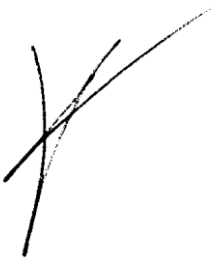
Generation Futures, Paris, France.